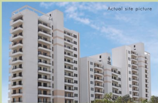
Actual site picture