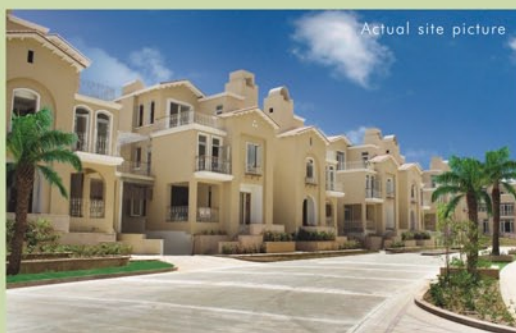
Actual site picture