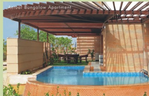
Actual Bungalow Apartment