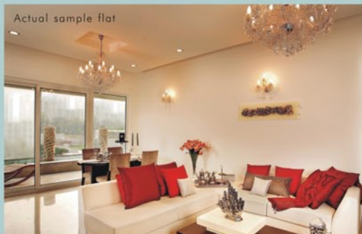
Actual sample flat