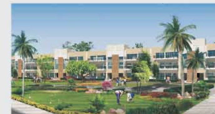
◆ Ground + 2 Spacious Independent Floors

A cluster of independent floors, RPS Palms brings home the concept of affordable 'good living' spread across 20 acres. The immaculate space planning, stunning façade and greenery make Palms the perfect destination for those who want both convenience and connectivity within reach.