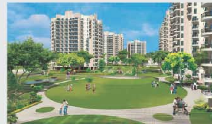
◆ 2+1 & 3 BHK Apartments