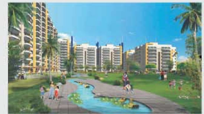
◆ 2/3/4+1 BHK Apartments & Penthouses

The group's basket of ongoing projects is all set to change the future of those who will associate with it. All the residential projects are part of RPS City, a 100 acre mega city being developed at Sector 88, Faridabad. The locale is not only scenic but is also strategically connected to the upcoming Metro station and under construction Badarpur flyover linking Faridabad to South Delhi. RPS City is only 3 km from the Noida Expressway.